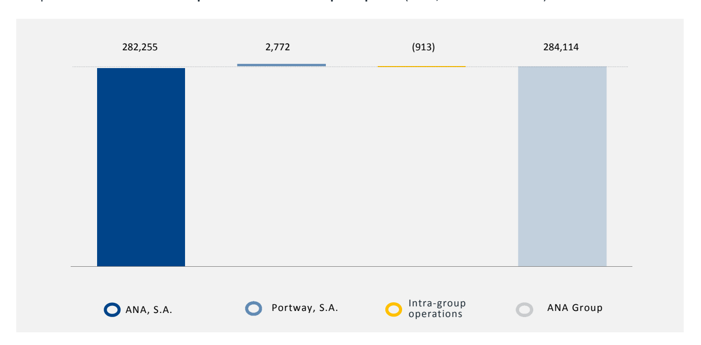
Graph 3. Breakdown of the net profits of the ANA Group companies (2018; thousand of euros)

The following graph shows the breakdown of net profits for each Group company in 2018: